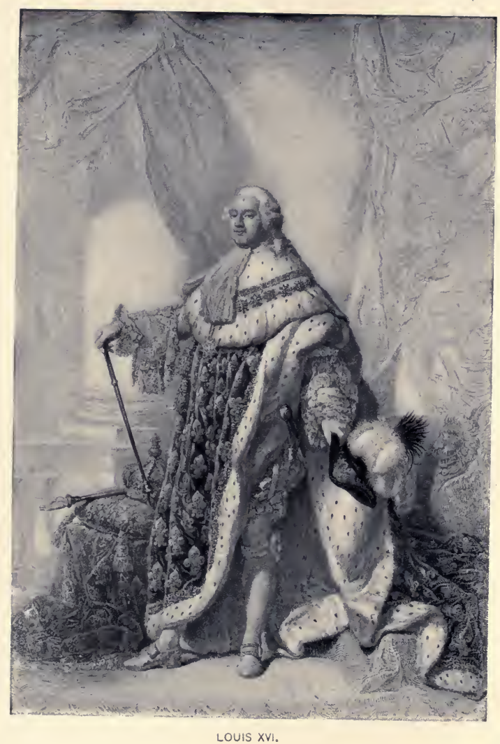
France, Frontispiece, Vol. Six