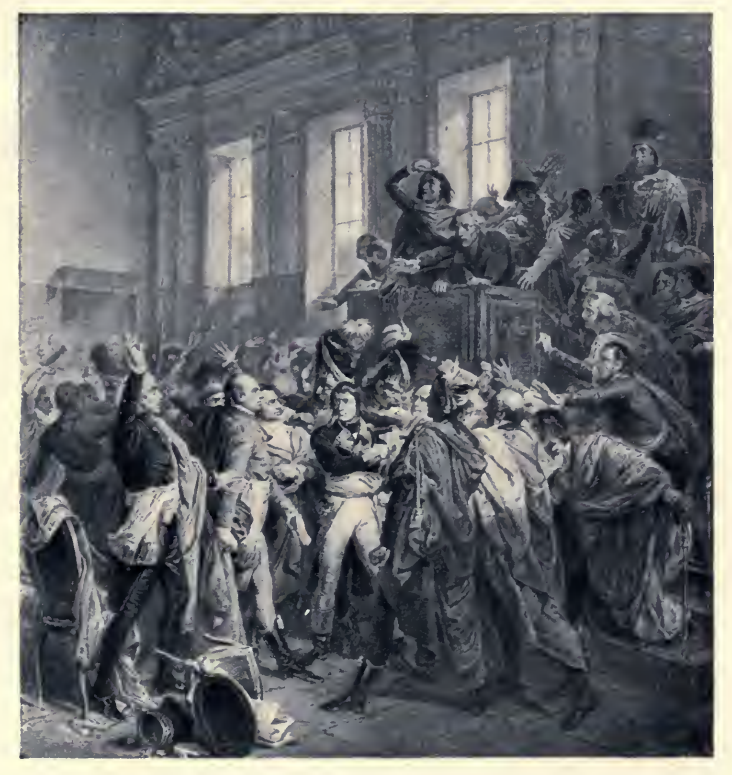
NAPOLEON AND THE MEMBERS